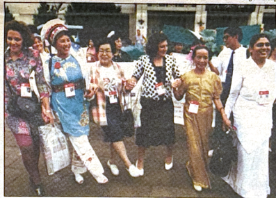
NGO participants dance gaily at the end of a workshop yesterday.

organizer, said that the conference is also concerned with the well-being of children. "We want to make sure the children are cared for."