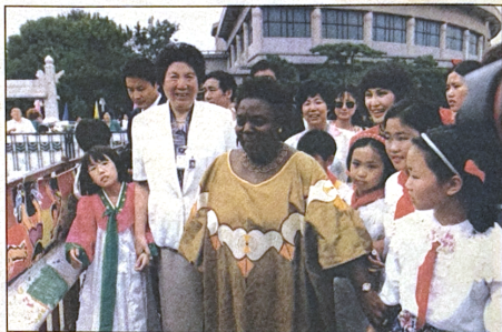
Gertrude Mongella, Secretary-General of the UN Fourth World Conference on Women, visits an international children's art exhibition in Beijing yesterday.

person of the Chinese People's Congress and Chairwoman of the All-China Women's Federation, also addressed the event and ex-