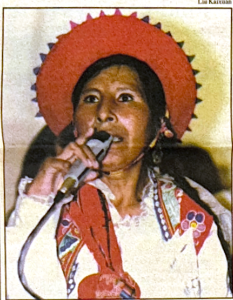
A woman from Peru shares her views on women's issues.